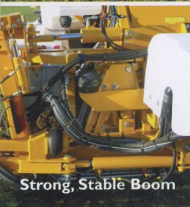
Strong, Stable Boom