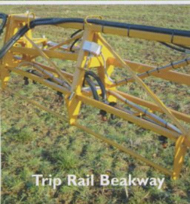
Trip Rail Breakway