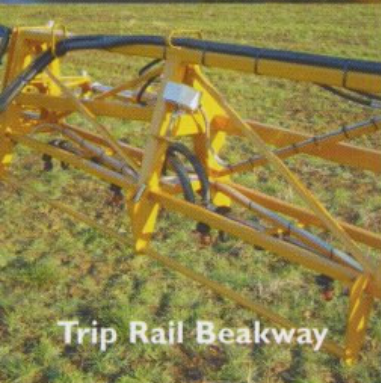
Trip Rail Beakway